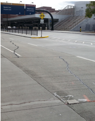
Mineta San Jose International Airport - Before Photo

Waterproofs PCC pavement and resists commonly used chemicals that destroy pavement such as silicone grease and de-icing agents like ethylene glycol, sodium chloride, trisodium phosphate and potassium acetate.