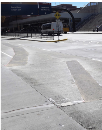
Mineta San Jose International Airport - After Photo